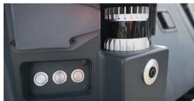
Connected to a set of advanced sensors such as LiDAR, radar, and cameras, the PATH technology is designed to convert any drive-by-wire platform into an autonomous vehicle