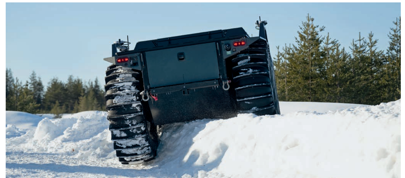
No matter what terrain or weather soldiers find themselves in, the Mission Master XT thrives

The Mission Master XT is robust enough to handle platoon or company sensors and weapon systems . With such a strong A-UGS at their side, units increase their range and firepower with heavier-calibre weapons and larger optics than they would otherwise be able to carry. The Mission Master XT dependably carries out long-range, amphibious, and heavy resupply missions over rough ground.