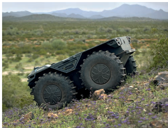
This A-UGS can operate in the most challenging terrains including water while maintaining its full payload capacity

The Mission Master CXT never turns back. Ice, snow, sand, rocky or mountainous terrain, stretches of water – nothing can stop this A-UGS from carrying out its missions. In the most difficult of situations, it remains capable of transporting its full payload capacity of 1000 kg . A continuous tire inflation system (CTIS) adjusts the A-UGS tires pressure while in motion, allowing the Mission Master CXT complete mobility in extreme terrain .