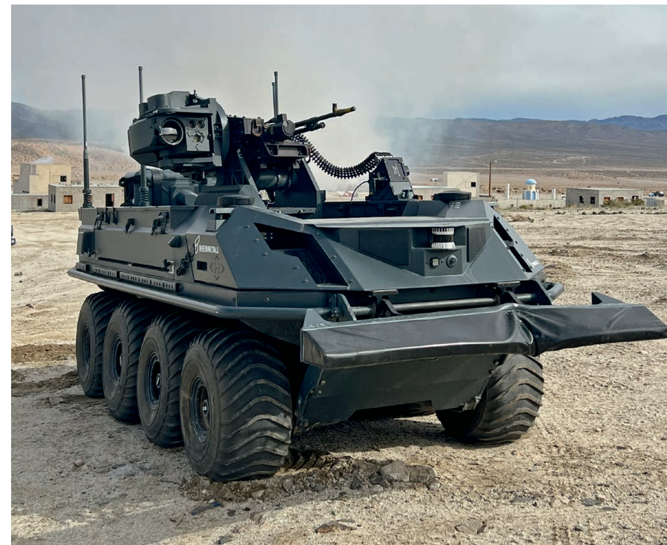
Mission Master SP – Armed Reconnaissance enhances situational awareness and frontline fire support

The Mission Master SP has been deployed during multiple live military exercises by land forces, including the German, US, Royal Dutch, and Polish armies. Various NATO partners, such as the UK, Australia, and a customer from the MENA region have already acquired this A-UGS.