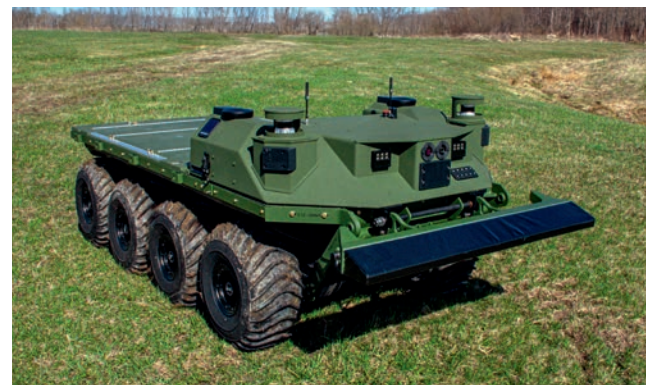
Mission Master SP – Rescue enhances casualty care effectiveness

A low-signature electric motor , silent drive mode, and compact profile let the Mission Master SP escape detection under threat. Dependable anywhere, the A-UGS maneuvers easily in demanding environments. Standard dimensions permit the vehicle to nimbly follow troops as a buddy , slipping between trees and even entering buildings.