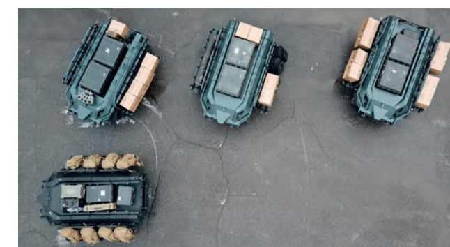
A few Mission Master SP forming a convoy

Rheinmetall PATH is engineered to deliver safe operation of the Mission Master family at all times in compliance with MIL-STD-882 and DEF-STAN 00-56 standards. Each control mode incorporates multiple layers of protection to ensure an always-safe vehicle operation. On top of this, Rheinmetall is committed to keeping a man in the loop for all weaponized operations and critical, life-affecting decisions, enabling only human decision-makers to act in these situations.