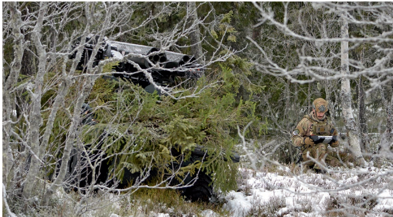
Rheinmetall PATH control interface displaying the "Road network" mode

Rheinmetall PATH offers an easy-to-use control interface on which all critical data is available at a glance. The centralized menu provides information on several statuses of each Mission Master vehicle and allows operators to exploit each payload in real-time.