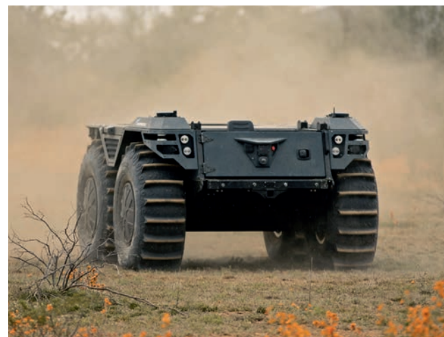
Mission Master CXT is designed with a removable emergency seat enabling the optionally crewed configuration when needed

Boasting incredible endurance, the Mission Master CXT keeps moving on even with one-inch holes in the tires . The built-in emergency seat lets operators maintain control of the vehicle in case of fundamental necessity. There is an integrated ballistic protection for internal key components inside the vehicle. For extra reinforcement, optional Level 1 or 2 ballistic protection is available to further safeguard both the A-UGS and the equipment it carries.