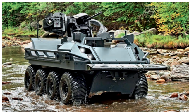
Mission Master SP – Fire Support equipped with Rheinmetall Fieldranger Multi remotely controlled weapon station

The Mission Master SP excels in any scenario requiring stealth and agility. This A-UGS is built for forward and last-mile resupply missions, silent watch operations, and carriage of light payloads, such as section sensors and weapon systems . Compact and highly mobile, the Mission Master SP follows light dismounted troops wherever they go, letting soldiers get closer to the enemy without being seen or heard.