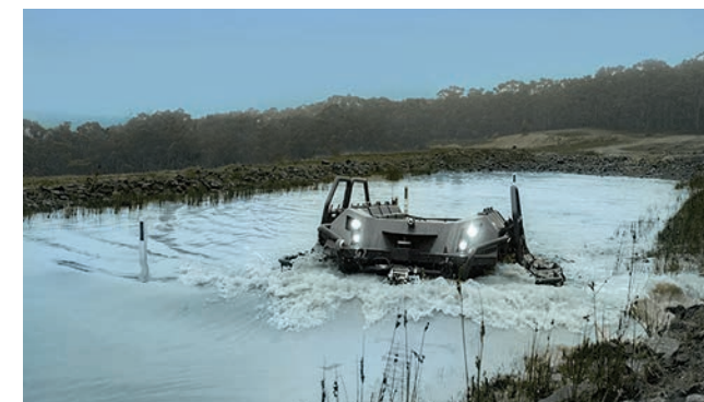
Mission Master SP – Cargo navigating through water

Highly transportable, the Mission Master SP can be towed or deployed by parachute to carry out missions in hard-to-reach terrain. This A-UGS can also be fitted with tracks to enhance mobility in deep snow and muddy conditions. A valuable ally in any situation, it comes equipped with a steel wire cable winch to assist in extracting equipment or debris.