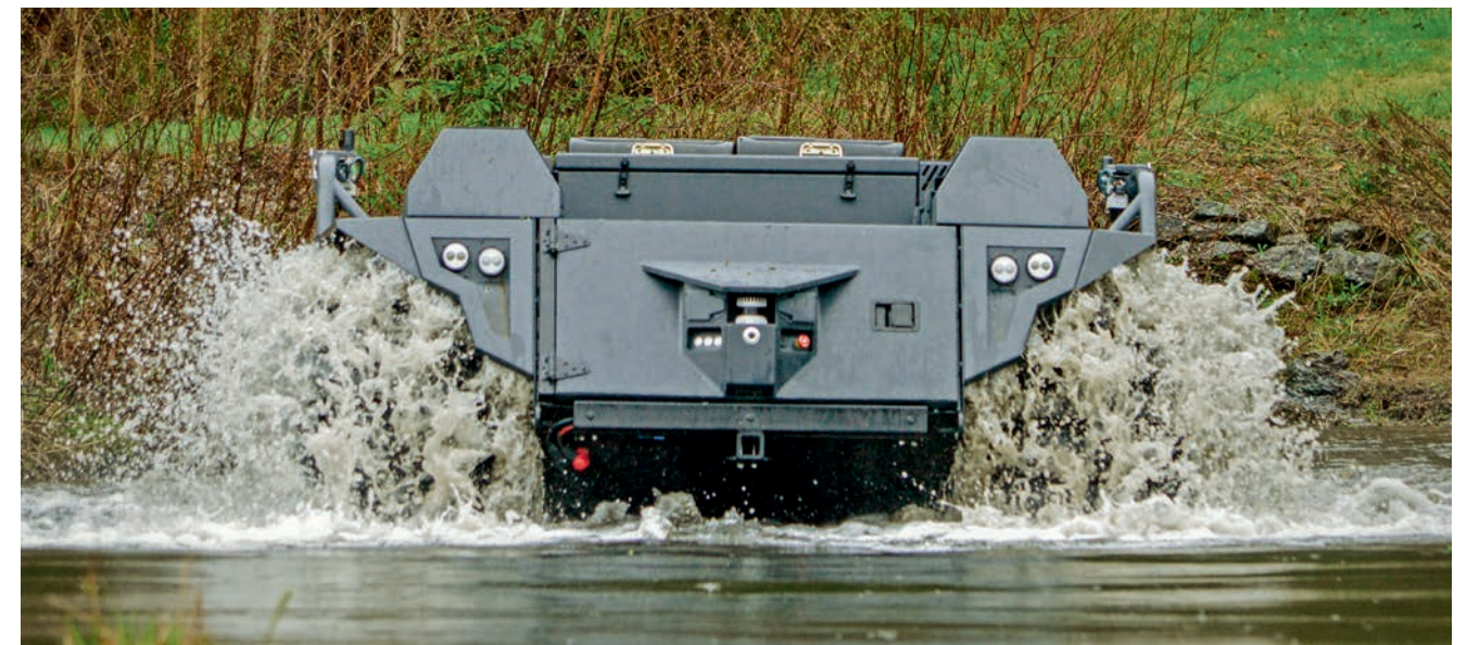
This A-UGS can float and swim while maintaining its full payload capacity

Boasting incredible endurance, the Mission Master XT keeps moving on even with one-inch holes in the tires . The built-in emergency seat lets operators maintain control of the vehicle in case of fundamental necessity. There is an integrated ballistic protection for internal key components inside the vehicle. For extra reinforcement, optional Level 1 or 2 ballistic protection is available to further safeguard both the A-UGS and the equipment it carries.