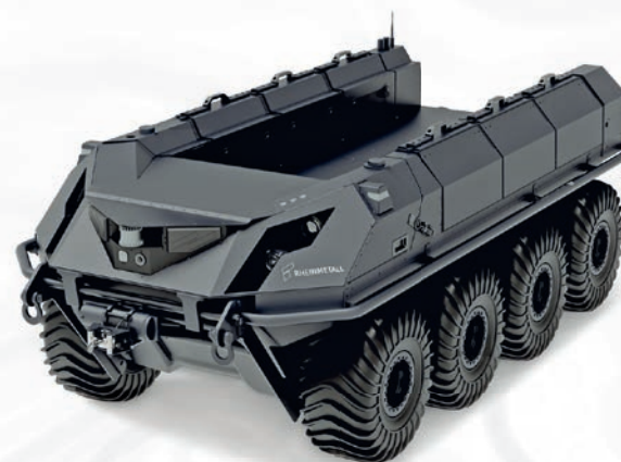
Mission Master SP

* May vary according to final configuration