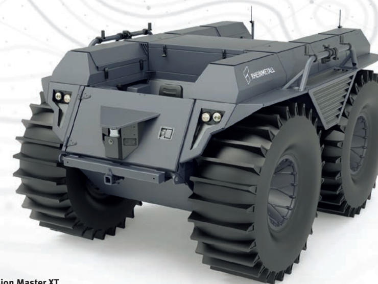
Mission Master XT