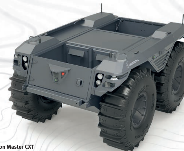
Mission Master CXT