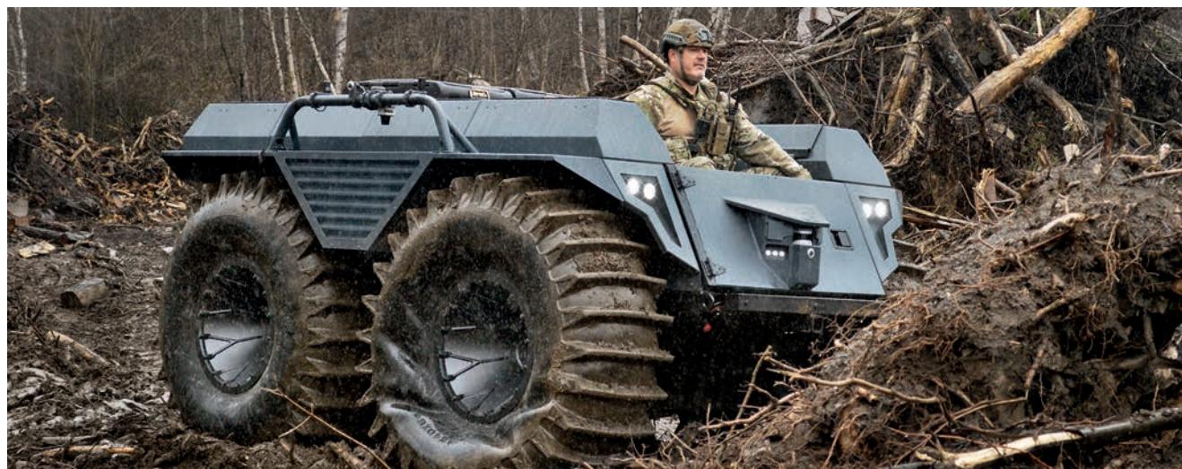
Mission Master XT is designed with a built-in seat enabling the optionally crewed configuration when needed

The Mission Master XT never turns back. Ice, snow, sand, rocky or mountainous terrain, stretches of water – nothing can stop this A-UGS from carrying out its missions. In the most difficult of situations, it remains capable of transporting its full payload capacity of 1000 kg . A continuous tire inflation system (CTIS) adjusts the A-UGS tires pressure while in motion, allowing the Mission Master XT complete mobility in extreme terrain .