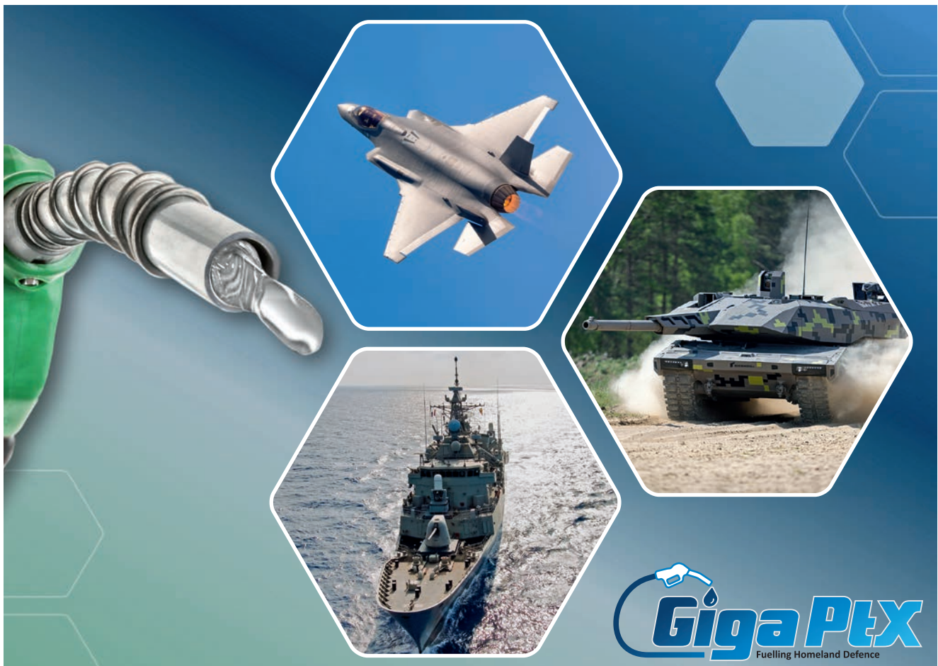
Different kinds of e-fuels can be provided, such as sustainable aviation fuel, diesel and marine diesel.

This is where synthetic drop-in fuels come into play. These can be produced anywhere from electricity, water and CO 2 and can be used in existing logistics systems, vehicles and aircraft due to their properties. Rheinmetall’s Giga-PtX project vision is a network of several hundred decentralised, large-scale synthetic fuel production plants with a unit size of up to 50 MW. Each plant locally combines the components of energy generation, hydrogen, CO 2 supply, and fuel synthesis and is ideally installed in close proximity to military units or pipeline systems. Using renewable energy, several thousand tonnes of fuel can be produced per plant each year. Thanks to this concept, no expansion of the electrical grid is required.