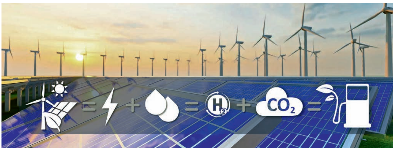
E-fuels can be produced from recycled CO 2 and renewable energy using the Fischer-Tropsch synthesis.