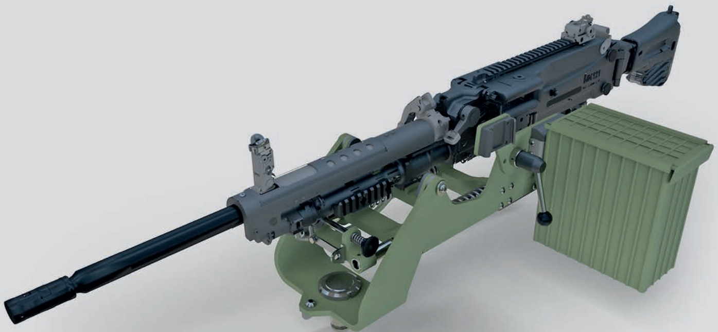
Softmount MG4/MG5 with 7.62 mm NATO general-purpose machine gun MG5