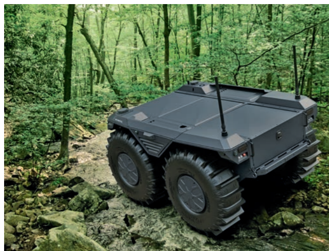
This A-UGV can operate in the most challenging terrains including water while maintaining its full payload capacity

The Mission Master CXT never turns back. Ice, snow, sand, rocky or mountainous terrain, stretches of water – nothing can stop this A-UGV from carrying out its missions. In the most difficult of situations, it remains capable of transporting its full payload capacity of 1000 kg . A continuous tire inflation system (CTIS) adjusts the A-UGV tires pressure while in motion, allowing the Mission Master CXT complete mobility in extreme terrain .