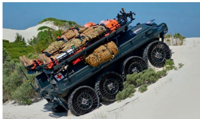
Mission Master SP – Rescue enhances casualty care effectiveness

A low-signature electric motor , silent drive mode, and compact profile let the Mission Master SP escape detection under threat. Dependable anywhere, the A-UGV maneuvers easily in demanding environments. Standard dimensions permit the vehicle to nimbly follow troops as a buddy , slipping between trees and even entering buildings.