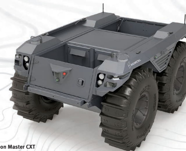
Mission Master CXT