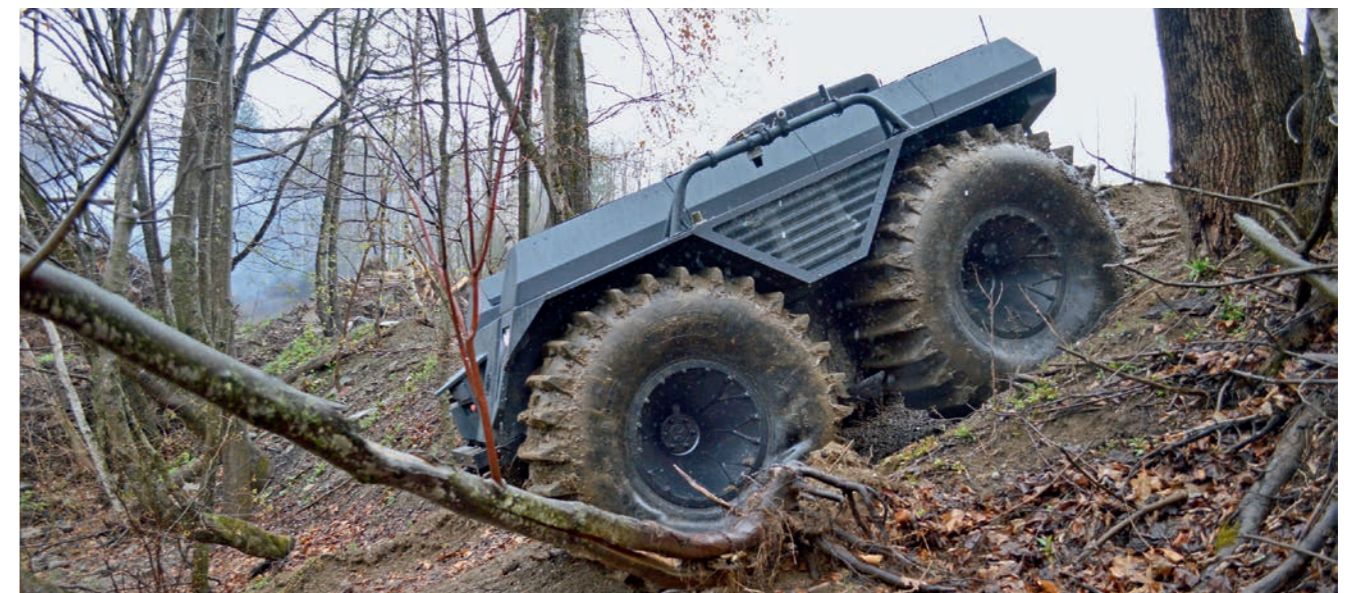
No matter what terrain or weather soldiers find themselves in, the Mission Master XT thrives

The Mission Master XT is robust enough to handle platoon or company sensors and weapon systems . With such a strong A-UGV at their side, units increase their range and firepower with heavier-calibre weapons and larger optics than they would otherwise be able to carry. The Mission Master XT dependably carries out long-range, amphibious, and heavy resupply missions over rough ground.