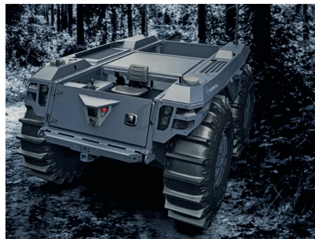
Mission Master CXT is designed with a removable emergency seat enabling the optionally-manned configuration when needed

Boasting incredible endurance, the Mission Master CXT keeps moving on even with one-inch holes in the tires . The built-in emergency seat lets operators maintain control of the vehicle in case of fundamental necessity. There is an integrated ballistic protection for internal key components inside the vehicle. For extra reinforcement, optional Level 1 or 2 ballistic protection is available to further safeguard both the A-UGV and the equipment it carries.