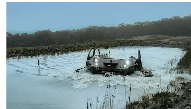
Mission Master SP – Cargo navigating through water

Highly transportable, the Mission Master SP can be towed or deployed by parachute to carry out missions in hard-to-reach terrain. This A-UGV can also be fitted with tracks to enhance mobility in deep snow and muddy conditions. A valuable ally in any situation, it comes equipped with a steel wire cable winch to assist in extracting equipment or debris.