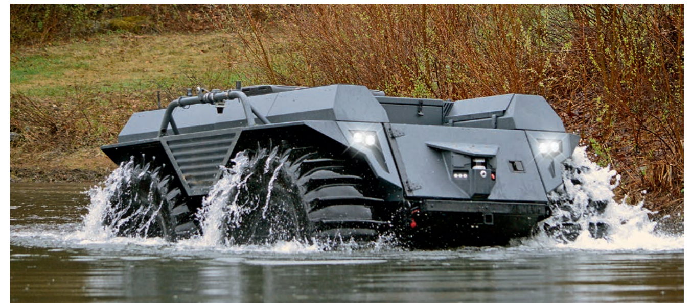
This A-UGV can float and swim while maintaining its full payload capacity

Boasting incredible endurance, the Mission Master XT keeps moving on even with one-inch holes in the tires . The built-in emergency seat lets operators maintain control of the vehicle in case of fundamental necessity. There is an integrated ballistic protection for internal key components inside the vehicle. For extra reinforcement, optional Level 1 or 2 ballistic protection is available to further safeguard both the A-UGV and the equipment it carries.