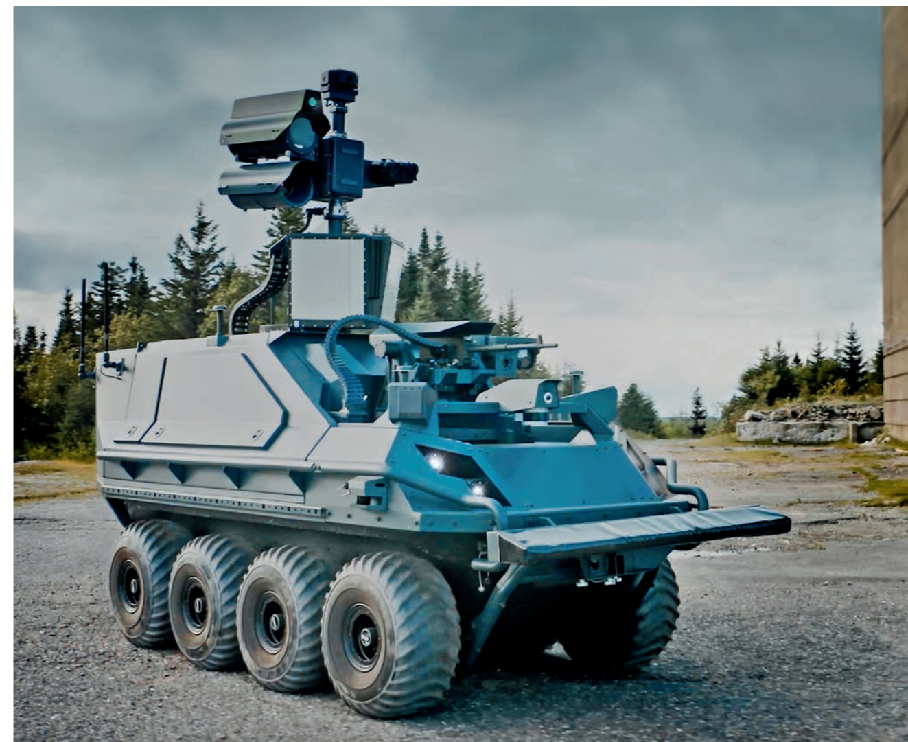
Mission Master SP – Armed Reconnaissance enhances situational awareness and frontline fire support

The Mission Master SP has been deployed during multiple live military exercises by land forces, including the German, US, Royal Dutch, and Polish armies. Various NATO partners, such as the UK, Australia, and a customer from the MENA region have already acquired this A-UGV.