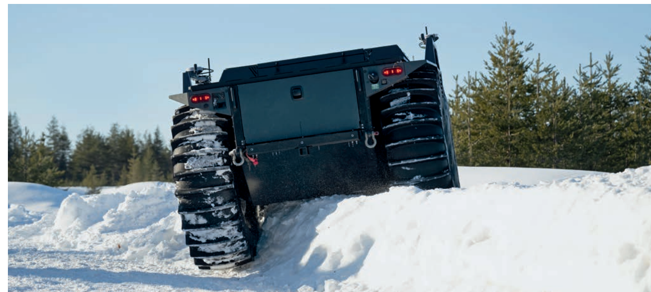
No matter what terrain or weather soldiers find themselves in, the Mission Master XT thrives

The Mission Master XT is robust enough to handle platoon or company sensors and weapon systems . With such a strong A-UGS at their side, units increase their range and firepower with heavier-calibre weapons and larger optics than they would otherwise be able to carry. The Mission Master XT dependably carries out long-range, amphibious, and heavy resupply missions over rough ground.