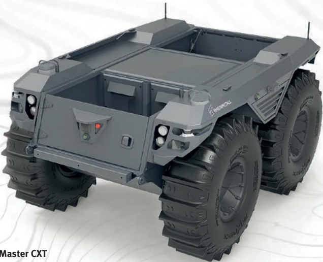
Mission Master CXT