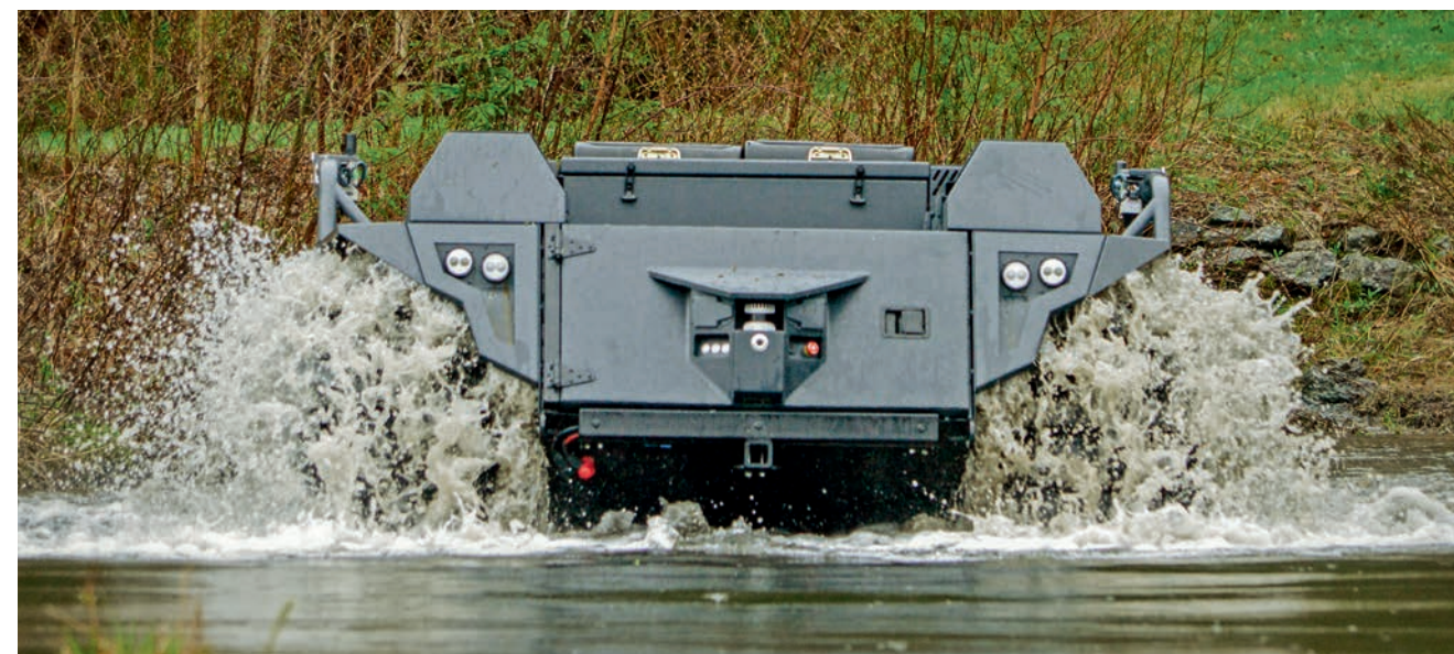
This A-UGS can float and swim while maintaining its full payload capacity

Boasting incredible endurance, the Mission Master XT keeps moving on even with one-inch holes in the tires . The built-in emergency seat lets operators maintain control of the vehicle in case of fundamental necessity. There is an integrated ballistic protection for internal key components inside the vehicle. For extra reinforcement, optional Level 1 or 2 ballistic protection is available to further safeguard both the A-UGS and the equipment it carries.