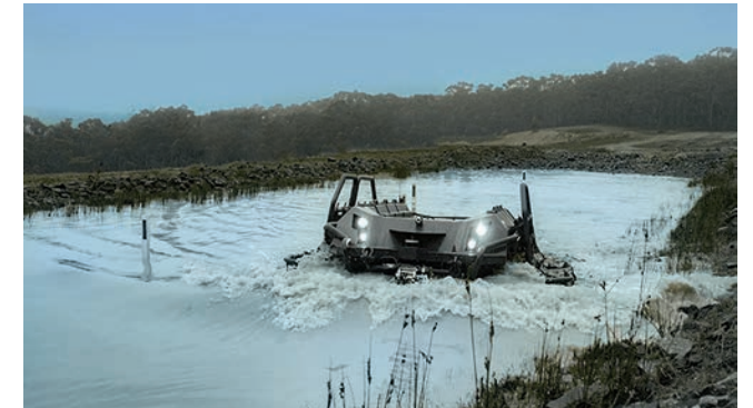
Mission Master SP – Cargo navigating through water

Highly transportable, the Mission Master SP can be towed or deployed by parachute to carry out missions in hard-to-reach terrain. This A-UGS can also be fitted with tracks to enhance mobility in deep snow and muddy conditions. A valuable ally in any situation, it comes equipped with a steel wire cable winch to assist in extracting equipment or debris.