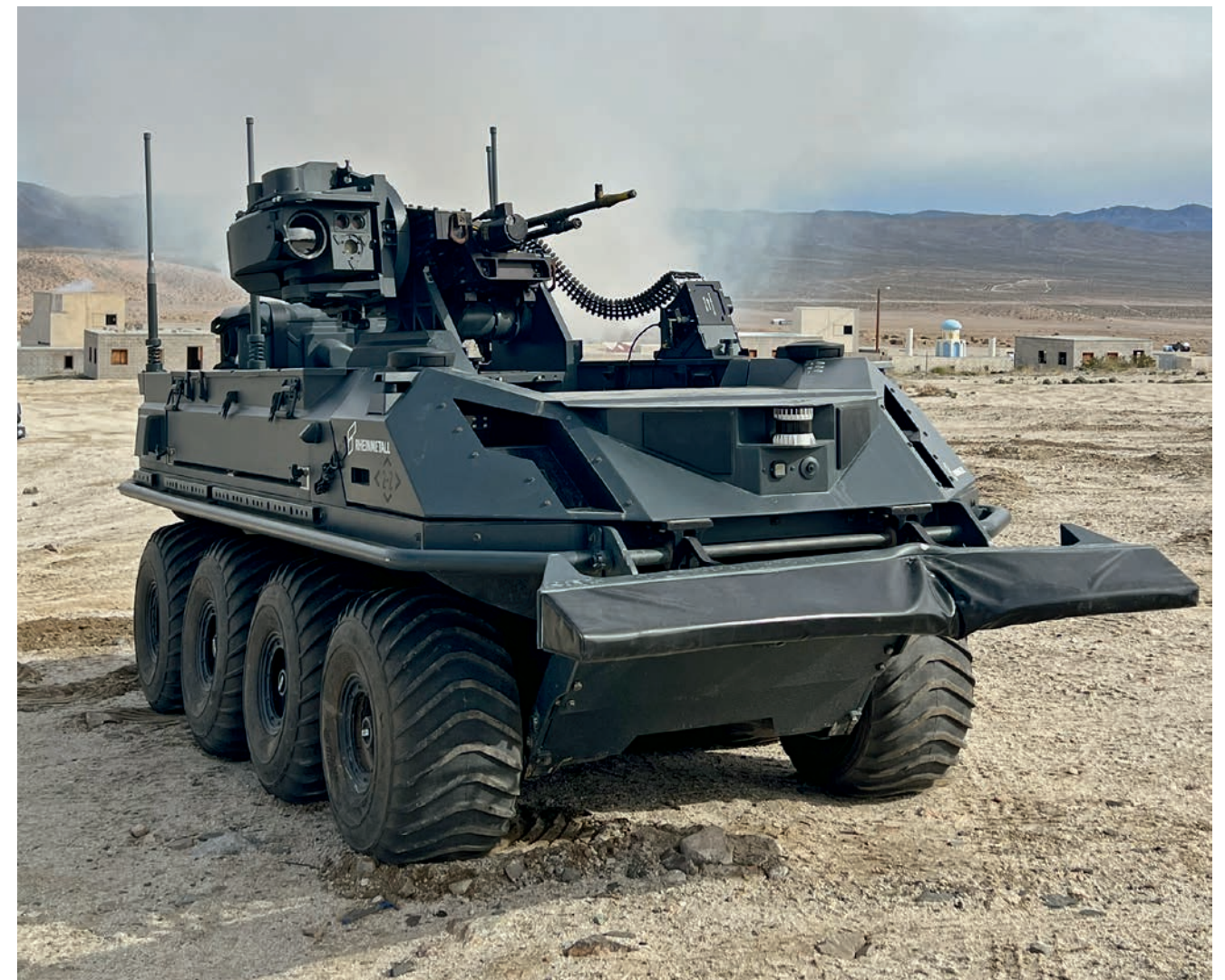
Mission Master SP – Armed Reconnaissance enhances situational awareness and frontline fire support

The Mission Master SP has been deployed during multiple live military exercises by land forces, including the German, US, Royal Dutch, and Polish armies. Various NATO partners, such as the UK, Australia, and a customer from the MENA region have already acquired this A-UGS.