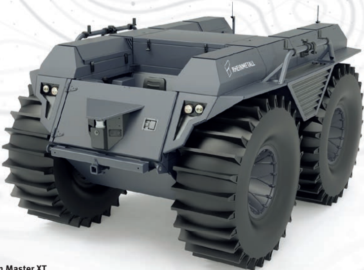
Mission Master XT