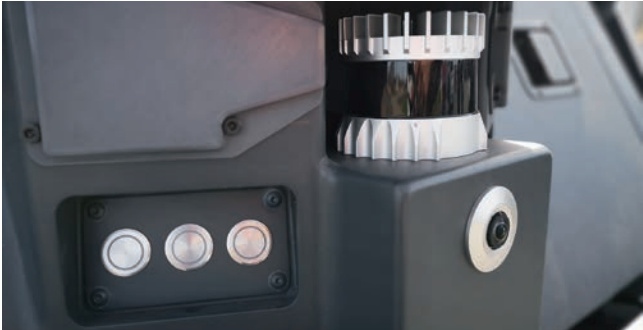
Connected to a set of advanced sensors such as LiDAR, radar, and cameras, the PATH technology is designed to convert any drive-by-wire platform into an autonomous vehicle

With its longstanding experience supporting forces around the world, Rheinmetall has acquired an incomparable skill set in network-enabled operations and system integration.