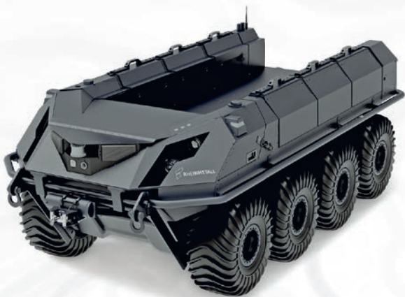
Mission Master SP