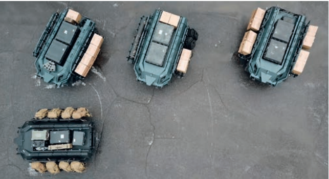
A few Mission Master SP forming a convoy

Rheinmetall PATH is engineered to deliver safe operation of the Mission Master family at all times in compliance with MIL-STD-882 and DEF-STAN 00-56 standards. Each control mode incorporates multiple layers of protection to ensure an always-safe vehicle operation. On top of this, Rheinmetall is committed to keeping a man in the loop for all weaponized operations and critical, life-affecting decisions, enabling only human decision-makers to act in these situations.