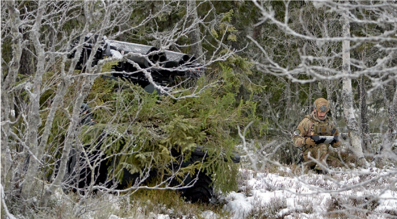
Rheinmetall PATH control interface displaying the “Road network” mode

Rheinmetall PATH offers an easy-to-use control interface on which all critical data is available at a glance. The centralized menu provides information on several statuses of each Mission Master vehicle and allows operators to exploit each payload in real-time.