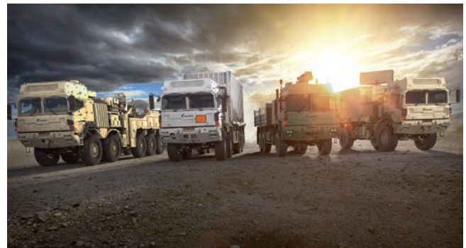
HX military trucks