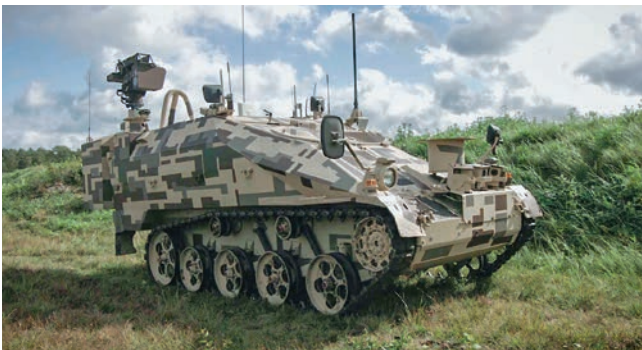
Digital Wiesel vehicle

PATH has also successfully provided the capability to operate uncrewed on other military vehicles including the Wiesel 2 Digital, the new Boxer 8x8 infantry fighting vehicle, and the HX family of high-mobility logistic vehicles.