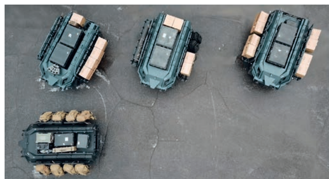
Rheinmetall Mission Master UGSs forming a convoy

Rheinmetall PATH is engineered to deliver safe operation of the uncrewed vehicles at all times, in compliance with MIL-STD-882 and DEF-STAN 00-56 standards. Each control mode incorporates multiple layers of protection to ensure an always-safe vehicle operation. On top of this, Rheinmetall is committed to keeping a man in the loop for all weaponized operations and any critical, life-affecting decision, enabling only human decision-makers to act in these situations.