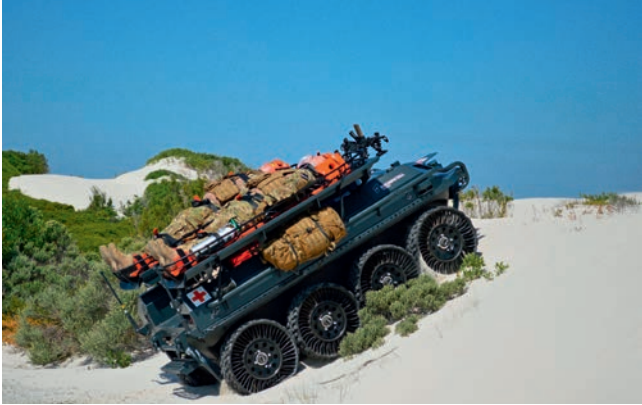
Driven by PATH A-kit, Rheinmetall Mission Master performs multiple mission profiles on its own