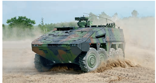
Boxer infantry fighting vehicle

The architecture of Rheinmetall PATH is open and flexible in order to be continually upgraded and improved. This way, it rapidly integrates new innovations and sustains future growth as customer's requirements evolve.