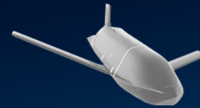
Surface-Launch Cruise Missile 370+ km