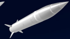
PrSM 400+ km