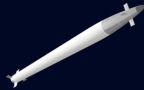
GMLRS 70+ km