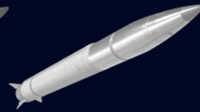
ER GMLRS 150 km