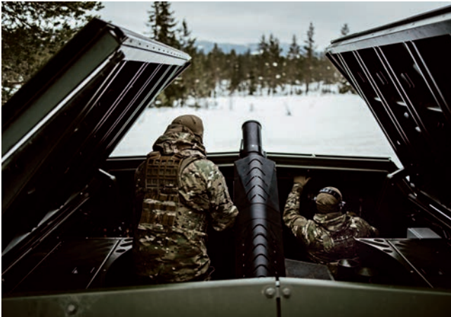
MMM integrated on ACSV G5