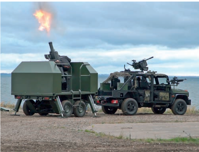
All Terrain Trailer 4x4 CARACAL (4.5t)