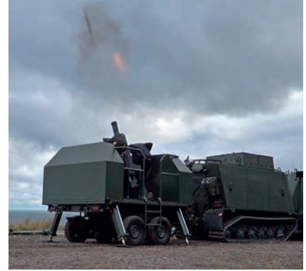
All Terrain Trailer BvS10