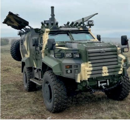
Eyder 4x4 (13t)

RAGNAROK integrated and fired in/from in following platforms: