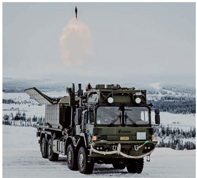
MMM integrated on HX 8x8