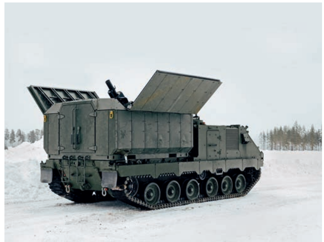
Mortar Mission Module