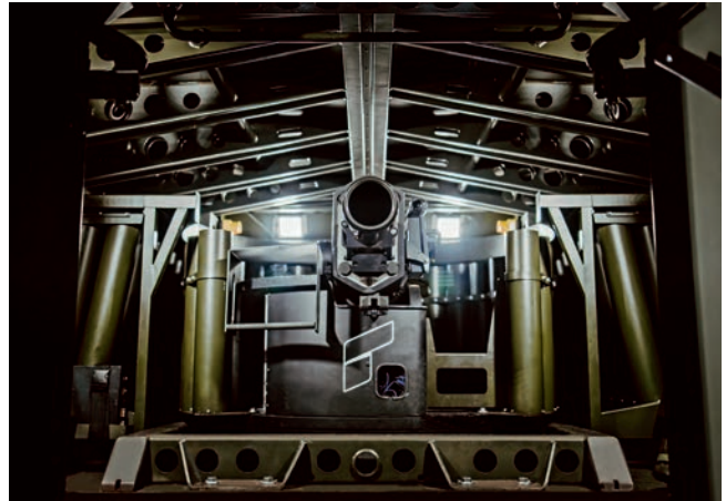
MMM integrated on ACSV G5