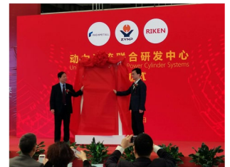
Opening Ceremony in Nanjing